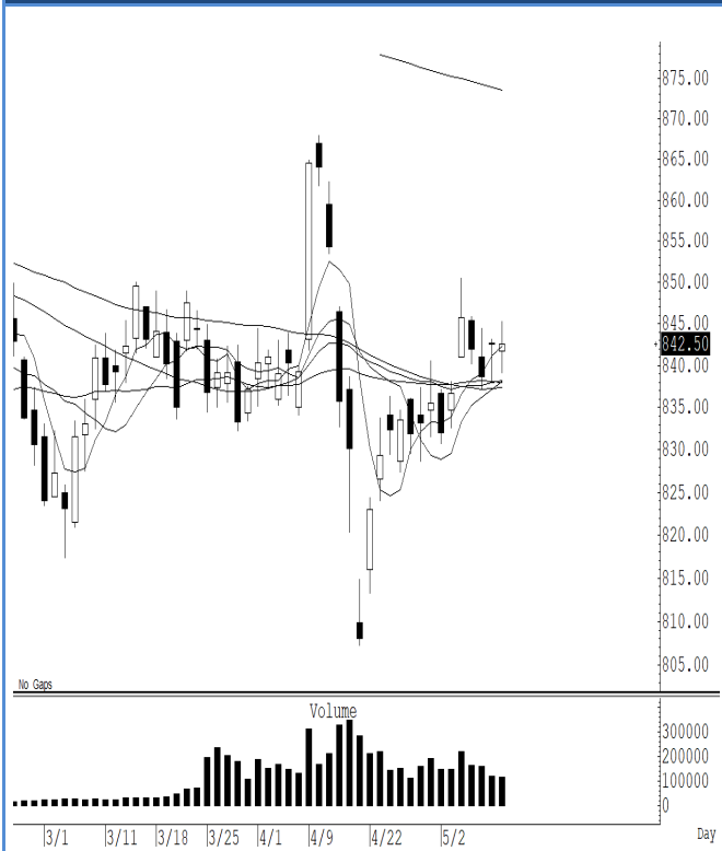
S50M24 (Close 842.50 Chg -0.20)